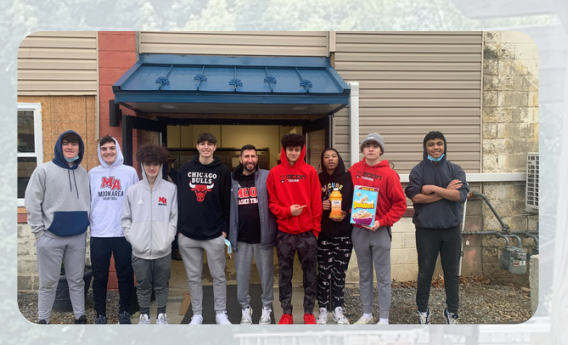
Moon Area High School Basketball team volunteered at the food pantry in November 2021.