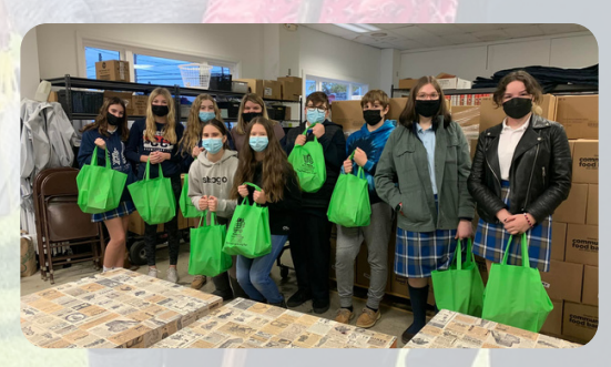
Archangel Gabriel School students donating snack packs.