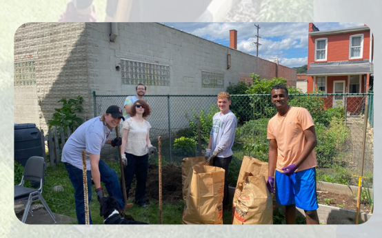
Volunteers from ServiceLink tend to the Coraopolis Community Garden.